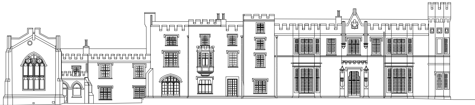
EAST FACING/ REAR ELEVATION