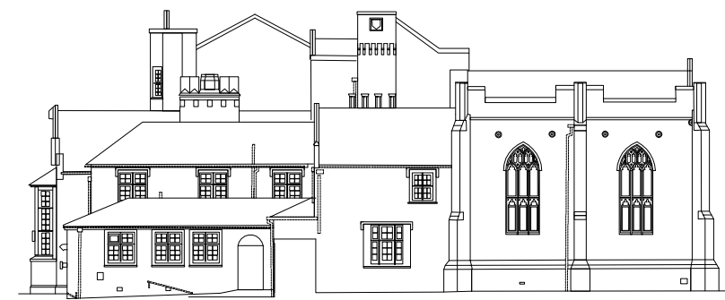
SOUTH FACING ELEVATION