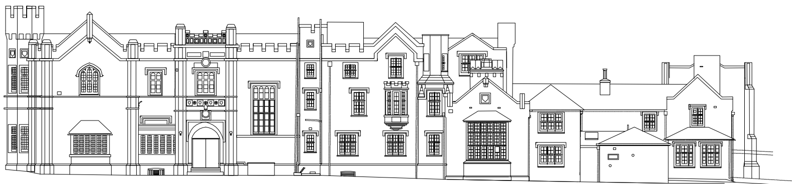
WEST FACE/ FRONT ELEVATION